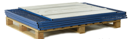
GLC20Z Folded (on a pallet)