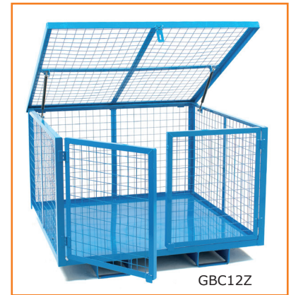
GBC12Z N.B. A Fork Lift will be needed to unload these units