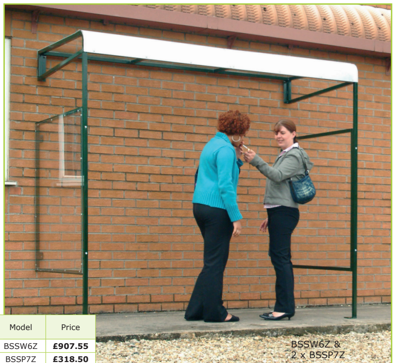
BSSW6Z & 2 x BSSP7Z